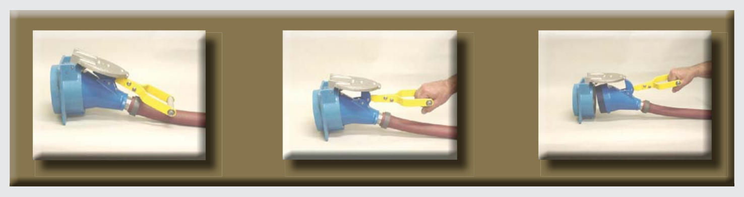
Plug and Jumper equipped with Disconnect Handle shown mated.