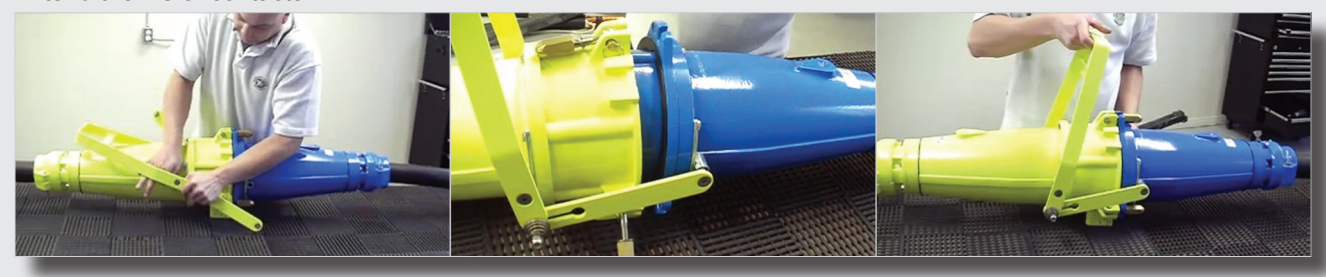
The closing tool allows for quick and easy connection and disconnection by one person.