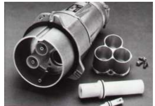
Ground plate & insulators shown removed

PATTON & COOKE ALSO MANUFACTURES JUNCTION AND SPLICE BOXES, CABLE HANDLING ACCESSORIES AND GROUND FAULT RELAYS.