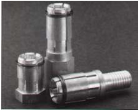
Female contact with external stainless steel springs.