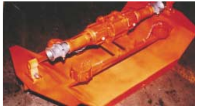
600 V Skid mount junction box (shown with male plugs attached)