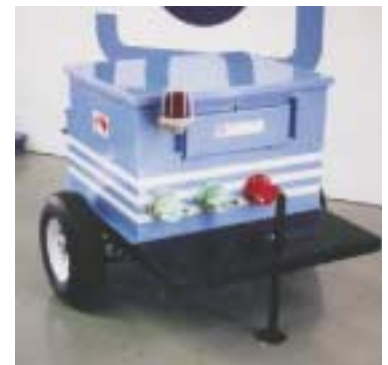
Equipment mount receptacles on portable power center