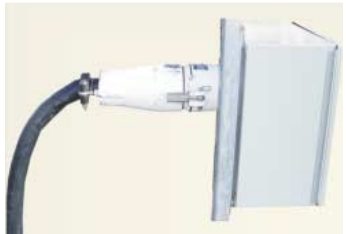
600 V cable mount plug with panel-mount receptacle