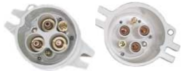
Front view of C06 cable mount couplers

Don't take chances with your electrical equipment. Choose the proven performer ... Patton & Cooke's 600 Volt, 250 Amp "quick flip" cable coupler.