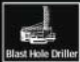
Blast Hole Driller