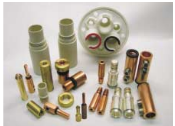
Live parts for C06 Series Couplers