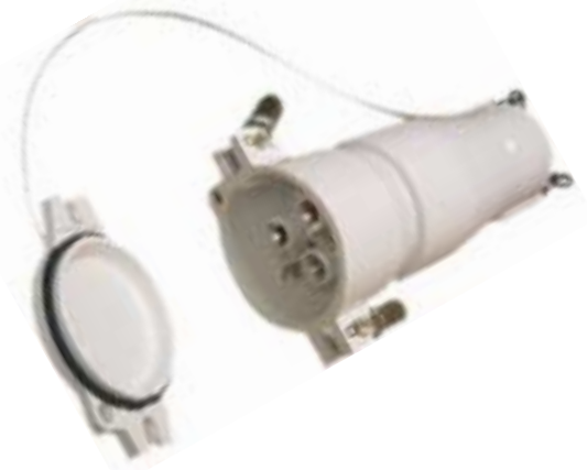
600 V, 250 Amp cable mount coupler with protective cover (included)

Don't take chances with your electrical equipment. Choose the proven performer ... Patton & Cooke's 600 Volt, 250 Amp "quick flip" cable coupler.