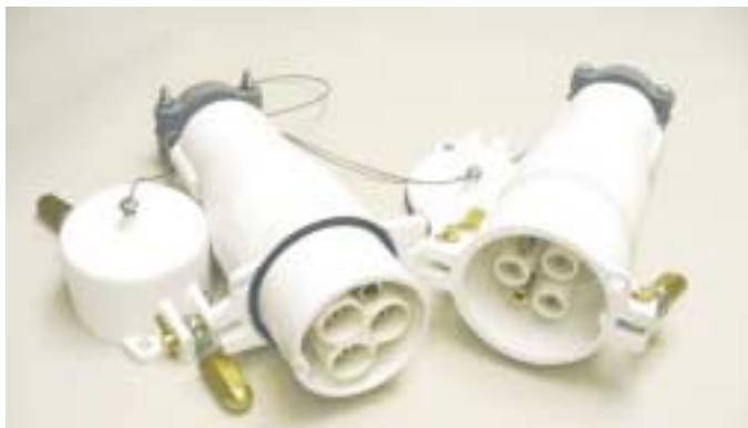
600 V cable couplers with cover / hood

Patton & Cooke also manufactures 600/1100 V, 5 & 8 kV, 15 kV and 25 kV cable couplers, ground fault products and a complete line of cable handling accessories.