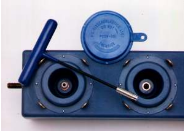
Top view of replaceable studs and protective cover.