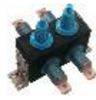
Y Splice , Single Phase, 25 kV with 600 Amp cylindrical bushings