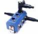
Y Splice , Three Phase, 15/25 kV, 200 Amp