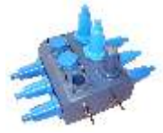
Y Splice , Three Phase, 12 Point, 15/25 kV, 200/600 Amp